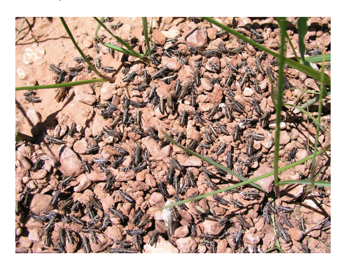
Figure 1. Hopper band of early instar nymphs of the Clearwing grasshopper Camnula pellucida , one of the most important agricultural grasshopper pests in the western U.S.

Sections 2 through 4 describe the problem domain and CARMA's evolving role as a decision support tool in the world of sustainable grasshopper pest management. Section 5 details CARMA's problem-solving approach as modeled after domain experts, as well as an overview of approximate-model-based adaptation in CARMA. Our proposed approach to evaluating approximate-model-based adaptation in CARMA is described in section 6 along with the results and a discussion. We include potential future work in section 7 followed by the conclusion.